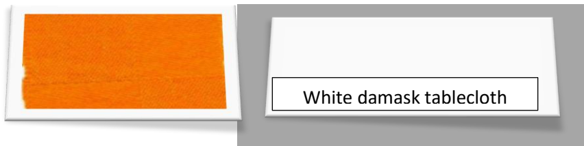
White damask tablecloth

Orange damask slip cloth as per attached sample 1 m x 1 m